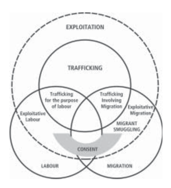
Interplay between exploitation, trafficking, migration, smuggling, labour and consent

Source: Trafficking in Women and Children in India, 2005, NHRC, Orient Longman, New Delhi